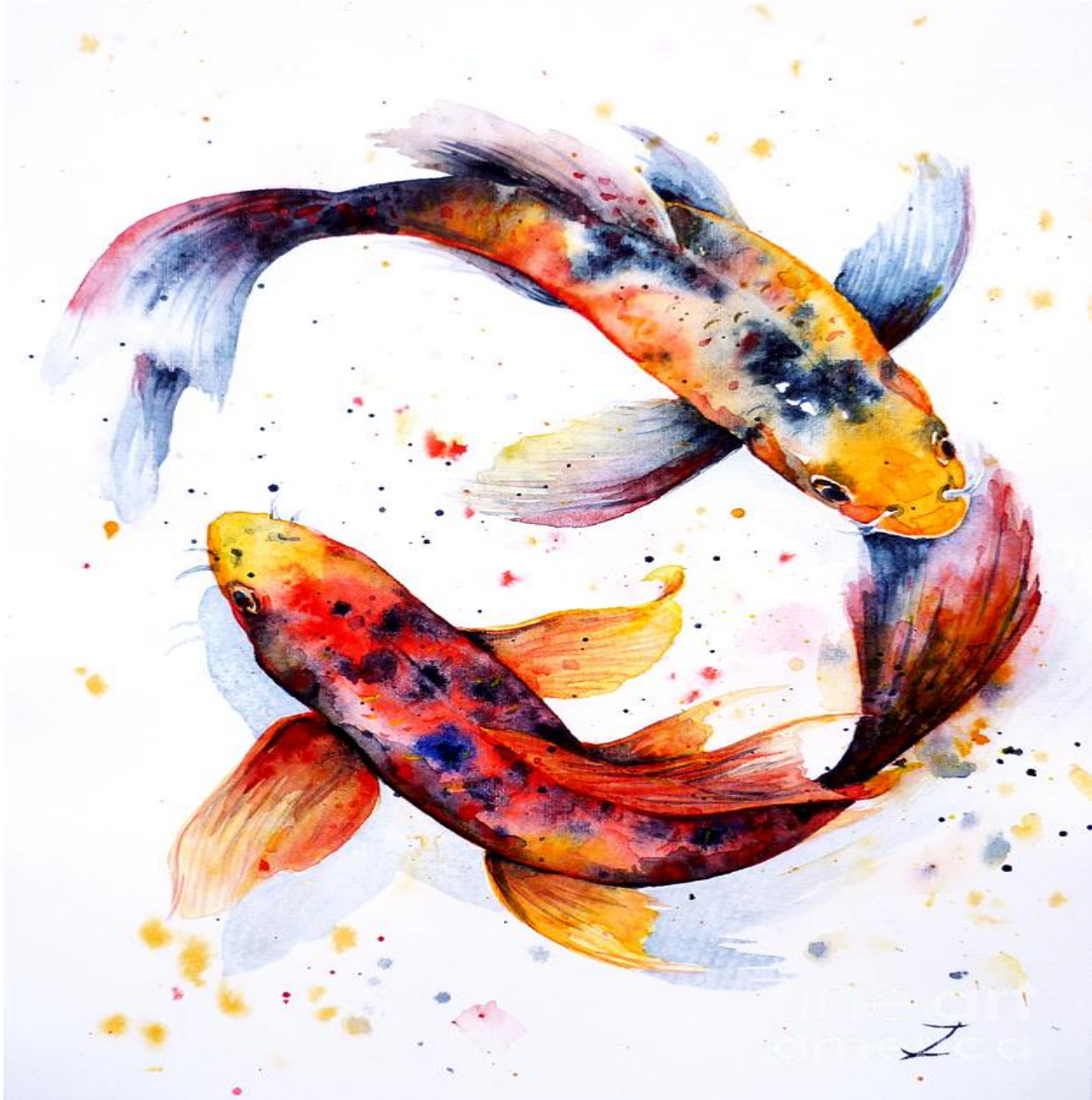
Watercolor Painting - Harmony by Zaira Dzhaubaeva